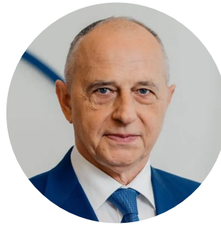
HE Mircea Geoană NATO Deputy Secretary General (former Romanian Ambassador to US)