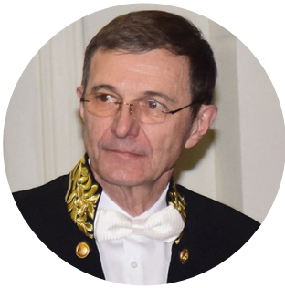
Acad. Ioan Aurel Pop President of the Romanian Academy