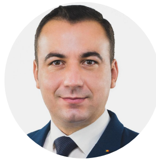
HE Bogdan Ivan Minister of Research, Innovation and Digitalization