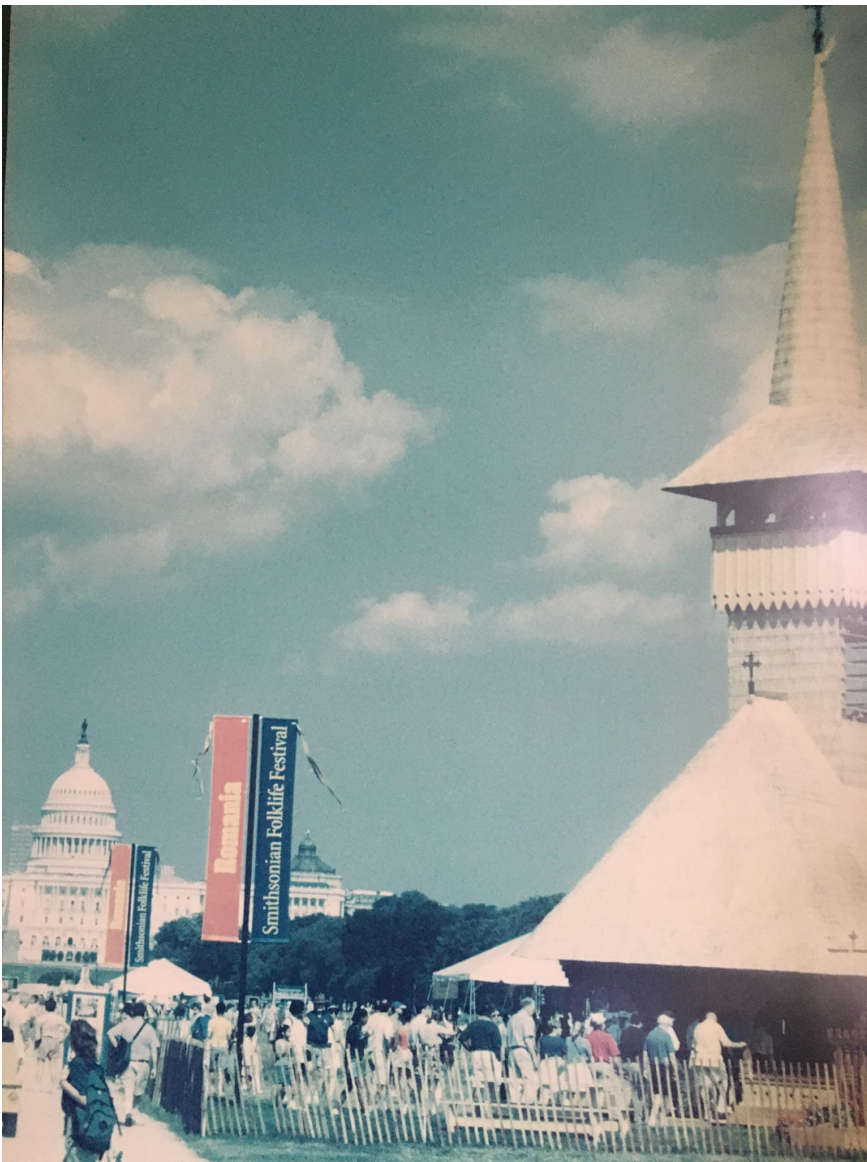
Romania at the Smithsonian Folklife Festival, USA, 1999