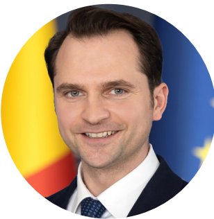
HE Sebastian Burduja Minister of Energy (Former Minister of Research, Innovation and Digitalization)