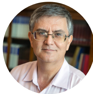
Acad. Mircea Dumitru Vicepresident of the Romanian Academy