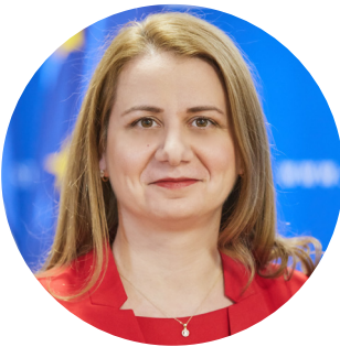
HE Ligia Deca Minister of Education