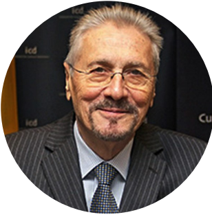
The Hon. Emil Constantinescu former President of Romania